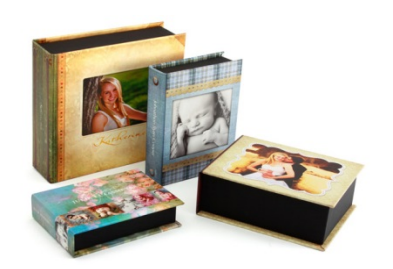
Image Boxes provide a personal, chic and upscale option for you to display and store your prints or albums. The boxes are made using sturdy wood construction, come in various sizes from 4x6 to 12x12 and various depths to

accommodate different volumes of storage. You can certainly combine our professional portraits with your own. Finishing options vary from a customized photo cover to different fabrics, leathers, suedes and chromaluxe. Customization includes adding an optional image on the inside cover flap with a latched closure, risers that fit in bottom of box to accommodate a lower amount of prints, or a CD/DVD insert. Your prints can also be mounted on