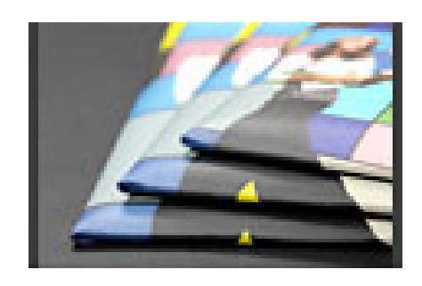
Satin "soft top" Thin Wrap