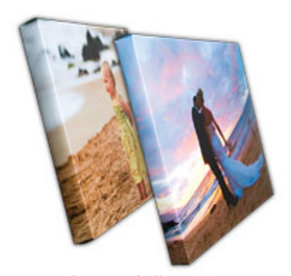
Canvas Gallery Wrap