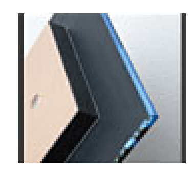
Thin Wrap with GatorFoam Backing To give the "Float" Effect when hung