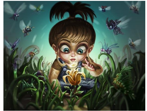
Illustration from upcoming childrens book: Lonely June©