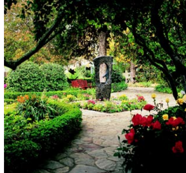
timely manor At the historic MacArthur Place, paths meander through seven acres of Victorian gardens dotted with whimsical sculptures and fountains.

For utterly unforgettable wedding digs, the bride and groom can check into The Ritz-Carlton Suite. The suite is pure elegance with white,