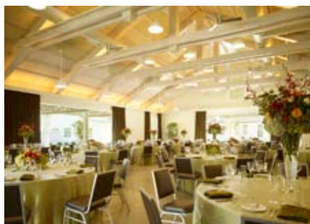
verdant views A sliding glass wall in the solstice barn at Solage Calistoga provides wedding celebrants with a full view of its wine country surroundings.

Tie the knot while nestled amid the sweeping natural beauty of Northern California at one of these premier resorts. By Bekah Wright