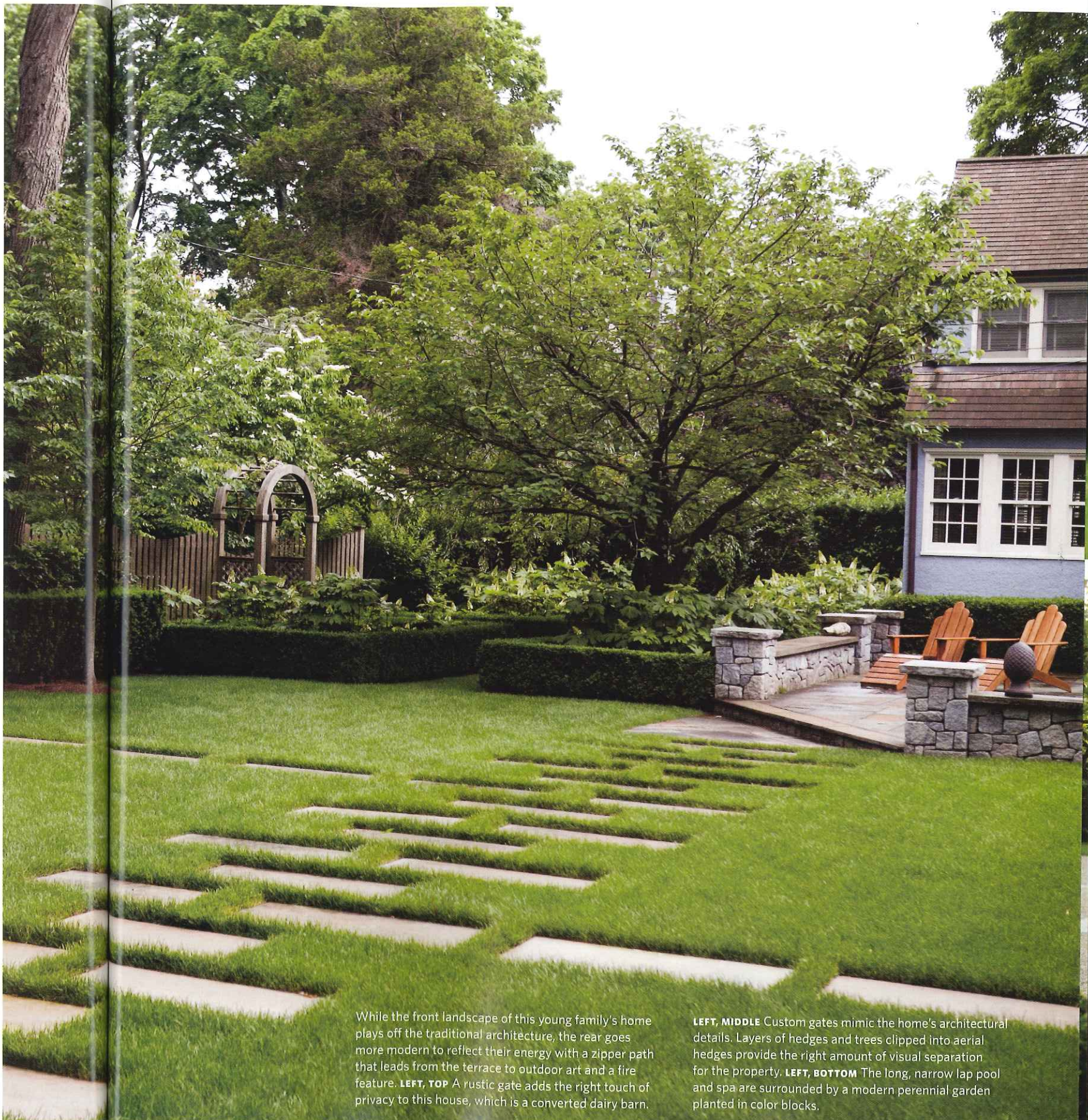
While the front landscape of this young family’s home plays off the traditional architecture, the rear goes more modern to reflect their energy with a zipper path that leads from the terrace to outdoor art and a fire feature. LEFT, TOP A rustic gate adds the right touch of privacy to this house, which is a converted dairy barn.