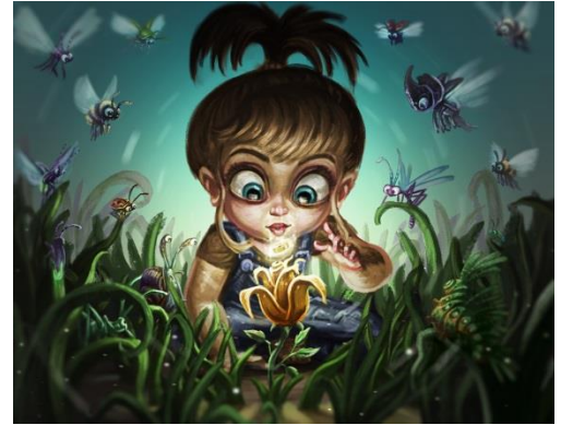
Illustration from upcoming childrens book: Lonely June©