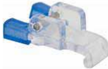
Button Sewing Foot

For our practice, please cut out the fabrics before class and come ready to sew. Foot photos are to help you with identification.