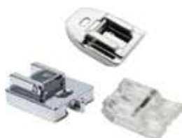
Invisible Zipper Feet