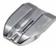
Bottom of Invisible Zipper Foot