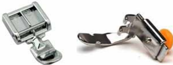
Types of Zipper Feet